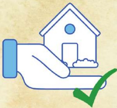
Extending the life of new buildings